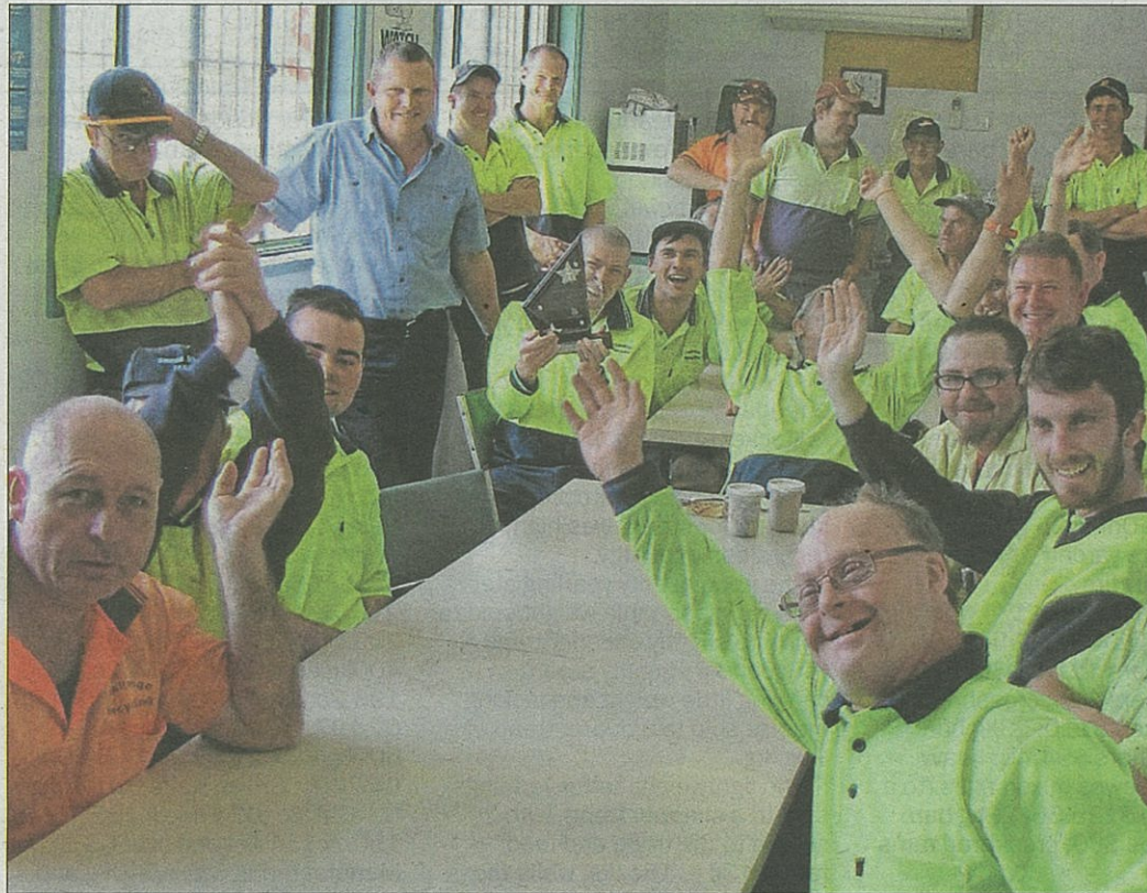
EXCITED WINNERS: Challenge Recycling employees were ecstatic to receive their Quality Business Award trophy on Monday morning.